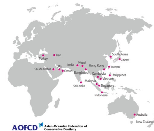
AOFCD Asian-Oceanian Federation of Conservative Dentistry